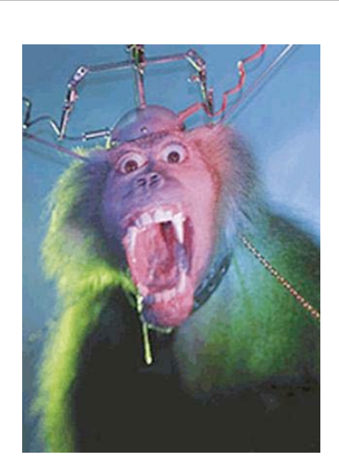
What does this image say to you?

What should the rules be for conducting research with animals?